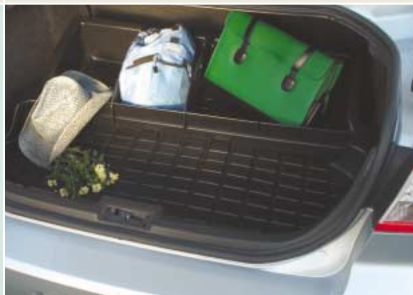
Trunk Cargo Organizer. One of our top-selling accessories, this organizer helps keep your personal items separated and readily accessible. For more details and additional organizing options, see page 7.