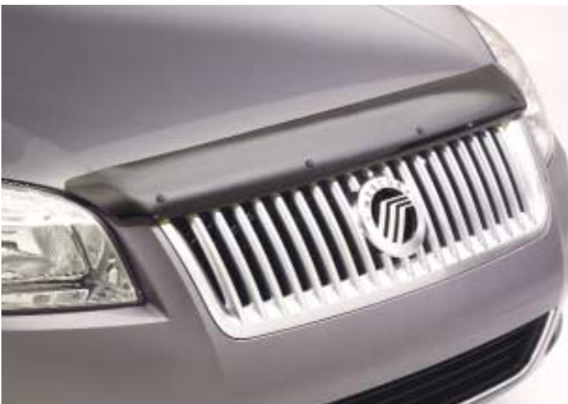
Bug Shields. Our top-selling bug shields provide protection for the edge of your hood and a stylish design. These and other exterior enhancements can be found on pages 4-7.

Turn the page and discover a complete catalog of great choices to help you personalize your new Grand Marquis, Mariner, Mariner Hybrid, Milan, Montego, Monterey or Mountaineer. Engineered for a perfect fit and long-wearing durability, Genuine Mercury Accessories offer uncompromising quality, versatility and style. What's more, you can rely on precise professional installation at your Mercury dealer and the backing of one of the industry's strongest limited warranties.