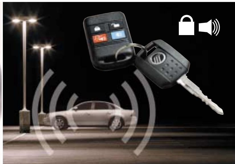
Vehicle Security System. On page 9, we offer products that are designed for your convenience and protection. This popular, state-of-the-art system protects your vehicle and its contents.