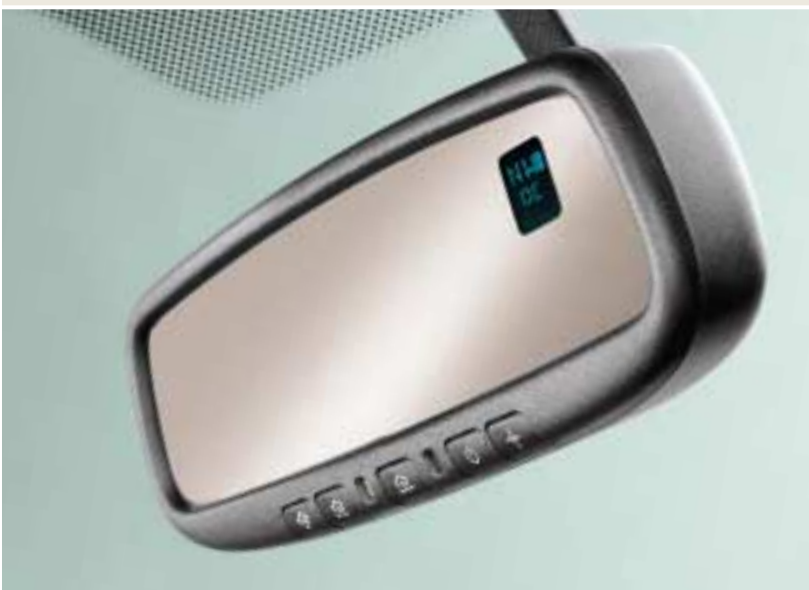
Electrochromic Mirrors and Electrochromic HomeLink® Mirrors These top-selling mirrors eliminate headlight glare, plus much more! See page 9 for more details on their state-of-the-art security features.